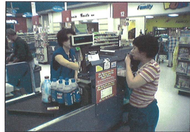
Abb. 15: Kassenbereich eines Vollsortimenters